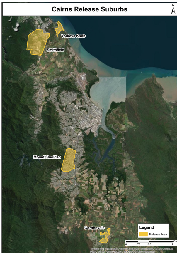
Fig. 1. Locations in the greater Cairns area, North Queensland, where egg samples for this study were obtained. Releases occurred in 2011 in Yorkeys Knob and Gordonvale, and in 2017 in Smithfield and Mount Sheridan.

Samples from 2018 were acquired via ovitraps deployed March–May 2018. Ae. aegypti eggs were collected from four release suburbs in Cairns (Gordonvale, Yorkeys Knob, Mount Sheridan, Smithfield). Eggs from each ovitrap were hatched and reared at 26 °C, 60% relative humidity with a 12 h light:dark cycle. Mosquitoes were aged at least 7 days post-emergence when their ovaries were obtained to enrich for Wolbachia , as wMel density is substantially higher in this tissue [10]. Ovaries from 2 to 30 Ae. aegypti females per trap were dissected and frozen in liquid nitrogen before being stored at –80 °C. As ovitraps are likely to contain full-sibling individuals [40, 41], each of these collections are considered to represent the offspring from a single Wolbachia -infected mother. A total of 30 samples across the four suburbs were sequenced (Table S1).