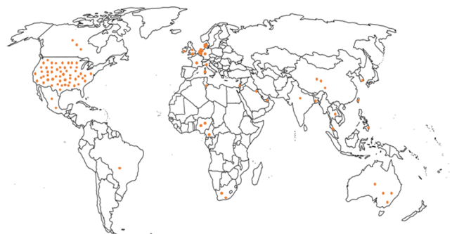
Fig 3. Geographical distribution of included studies.

Among the 56 studies assessed as observational study designs, 19 were cross-sectional, of which seven had high risk of bias [52–58], four had a moderate risk of bias [59–62] and eight had low risk of bias [63–70]. 15 were cohort studies; one study had a high risk of bias [71], five had a medium risk of bias [72–77], and eight had low risk of bias [78–85]. One study used a case-control study design and had a moderate risk of bias [86]. 14 were pre-post studies; one had a high risk of bias [87], 11 had medium risk of bias [88–98], and two had low risk of bias